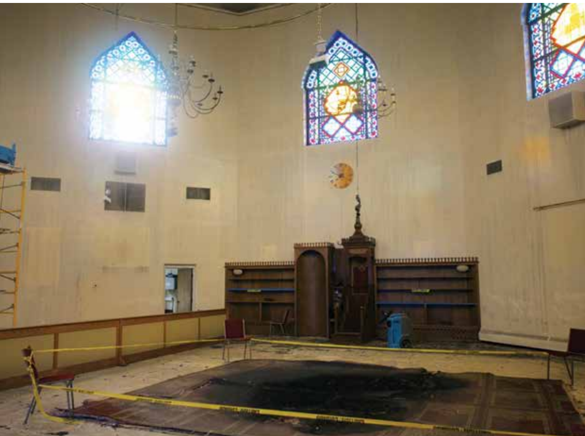
Arson-damaged interior of the Islamic Center of Greater Toledo in Toledo, Ohio.