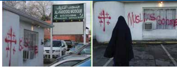
Vandals target Tennessee mosque.