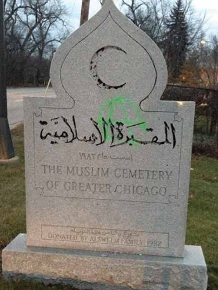
Vandalized Muslim cemetery in Illinois.