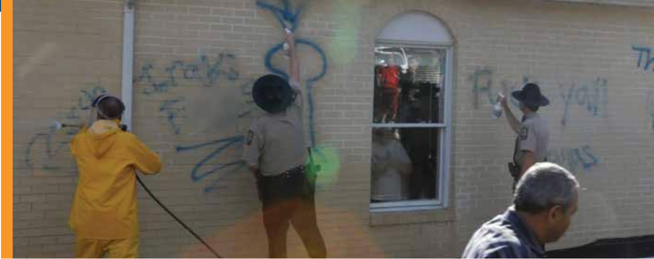
Hate graffiti being cleaned from the Islamic Center of the Shenandoah Valley in Harrisonburg, Va.