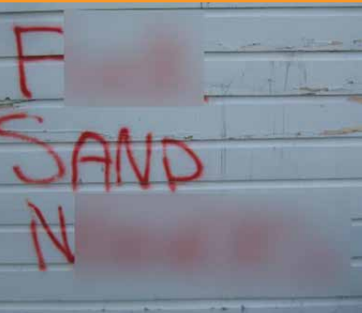
Hate graffiti on New York mosque.